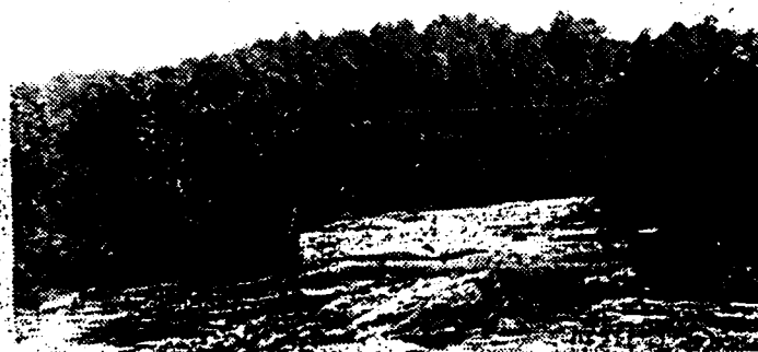
Archibald Holland Bridge over Raccoon Creek