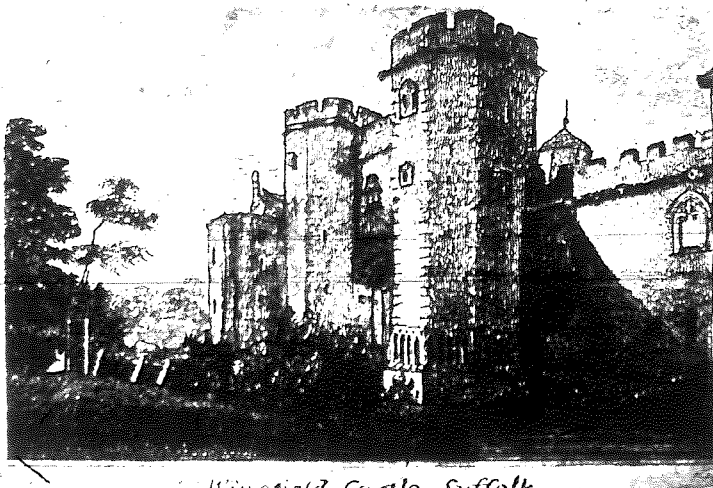
Wingfield Castle Suffolk.

Wingfield Family. Suffolk, England. Hanover Co. Va. Wilkes Co. Ga.