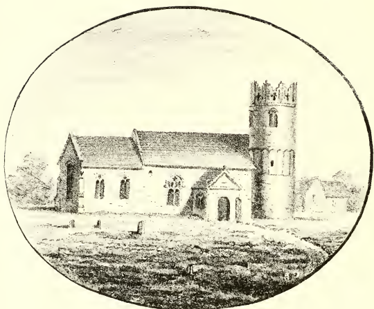
This View of Thorington Church is copied from a Volume of Drawings of Suffolk Churches, made by Isaac Johnson of Woodbridge, between 1793 and 1816.