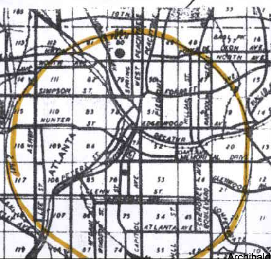
Archibald Holland 1826 Land Grant in downtown Atlanta