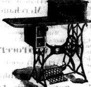
The Genuine Stewart Machine.