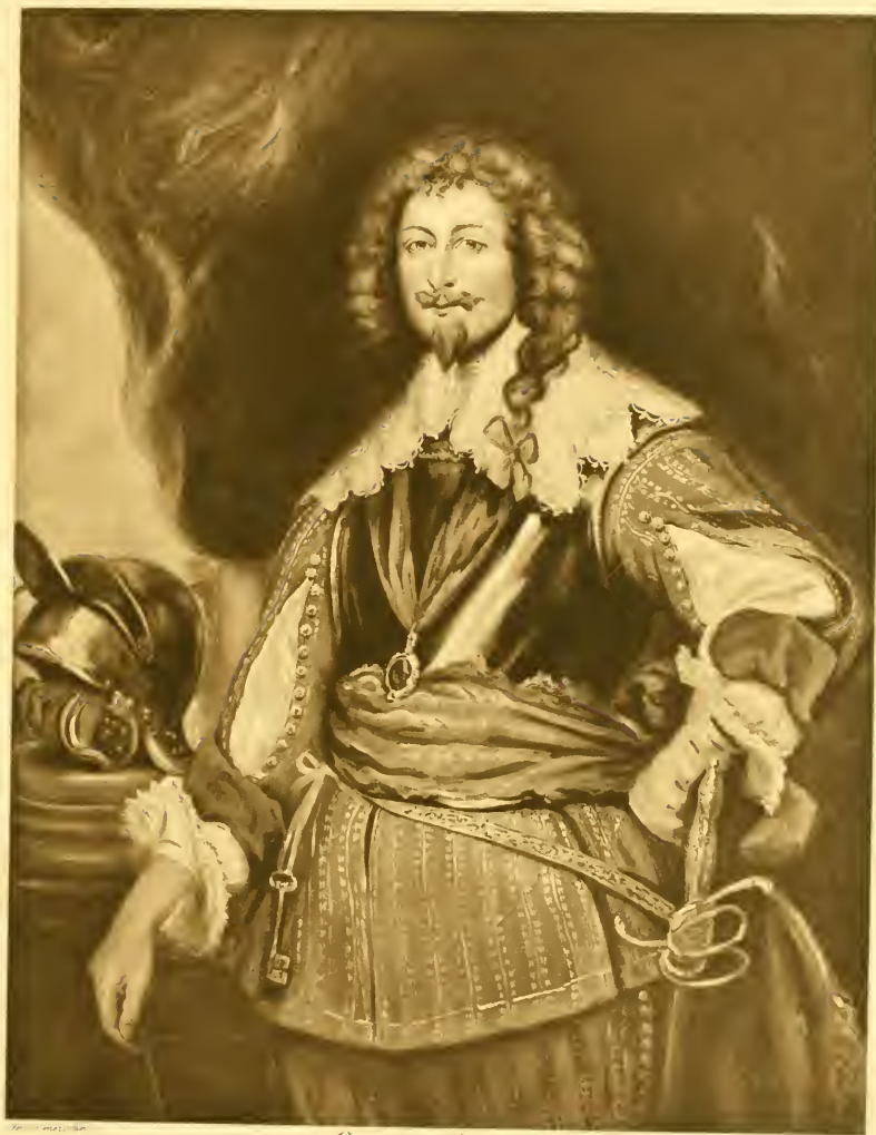
Edward Sackville. (Fourth Earl of Dorset) after the painting by Van Dyck