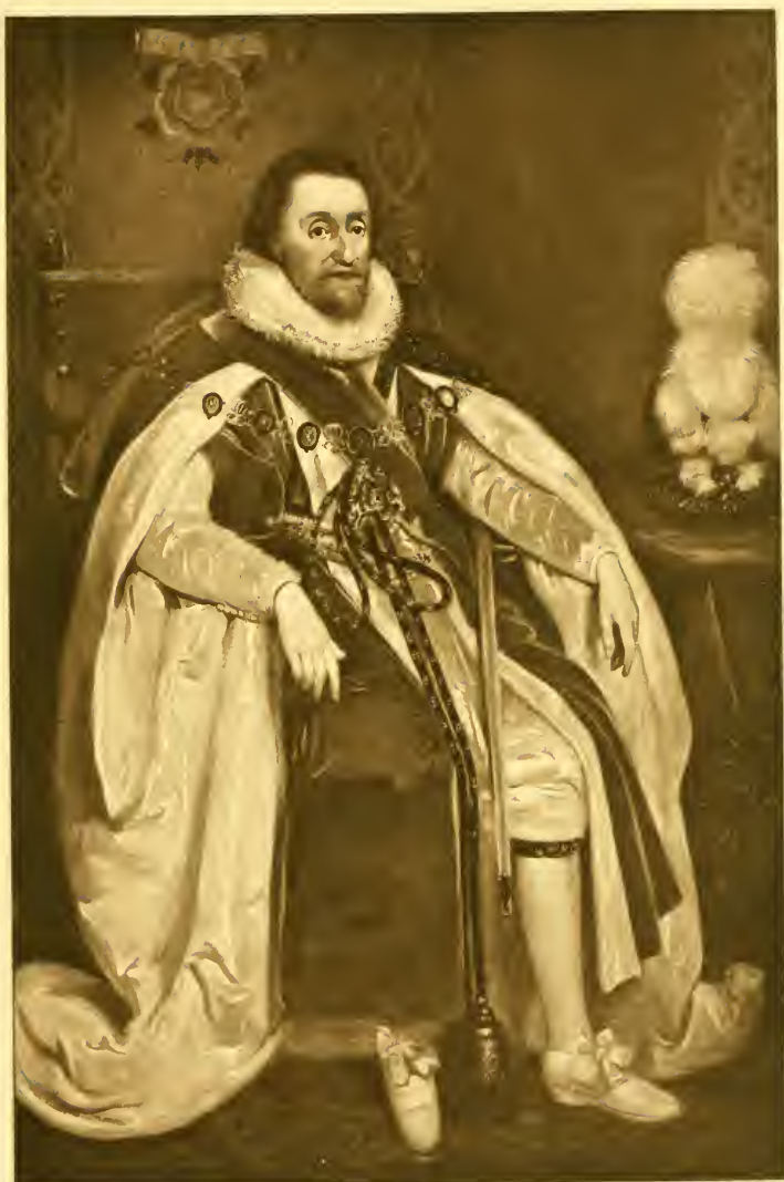
King James I from the painting by Paul Van Somer.