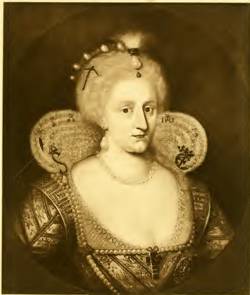
Queen Anne of Denmark from the painting by Paul Van Somer