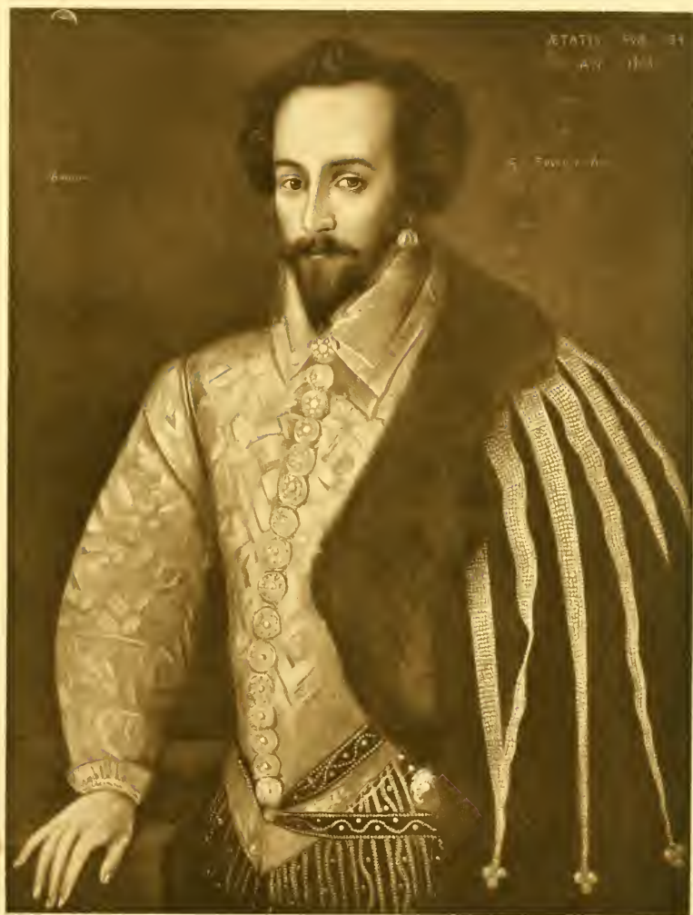
Sir Walter Raleigh, after the painting by Federico Zuccaro