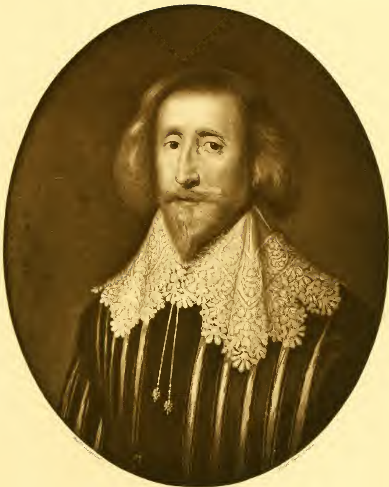
George Sandys. from the painting by Cornelius Janssen