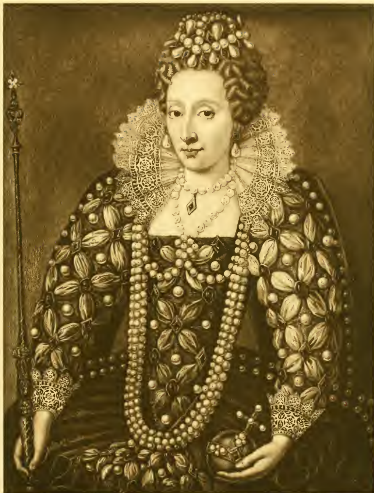
Queen Elizabeth from the painting by Federico Zuccaro.