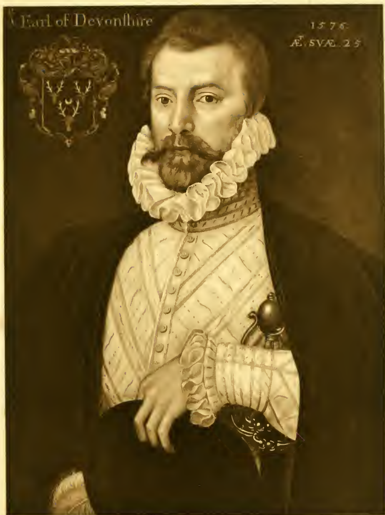
William Cavendish. (First Earl of Devonshire).