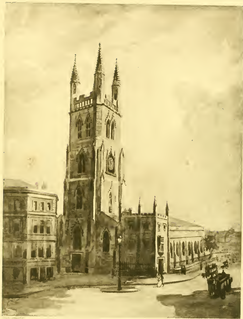
St. Sepulchre's Church, Holborn Viaduct, London. (the burial place of Captain John Smith)