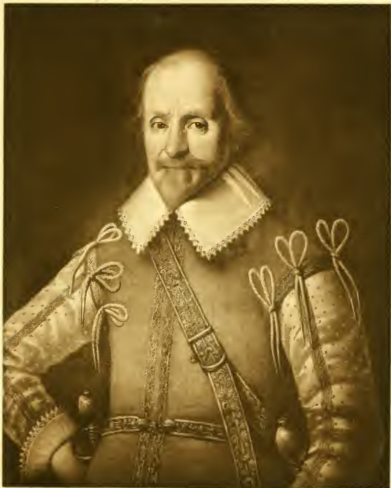
Sir Thomas Smythe. from the painting in The Skinner's Hall London