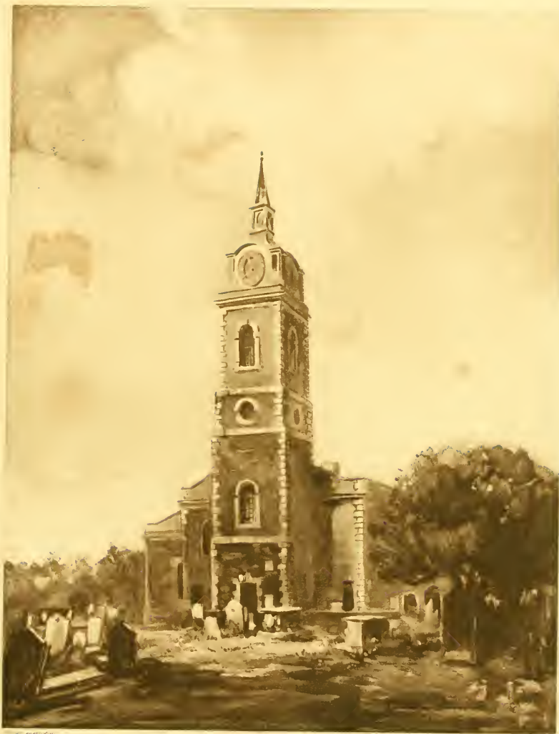
St. George's Church, Gravesend, Kent. (the burial place of General Bentinck)