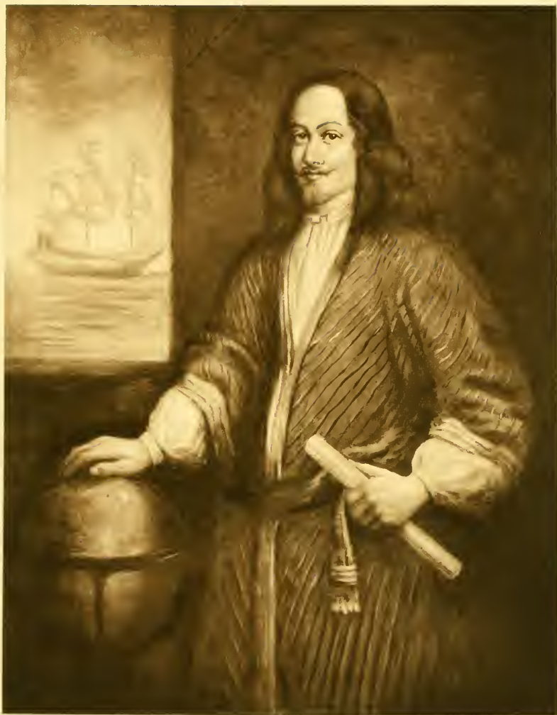
Sir George Somers.