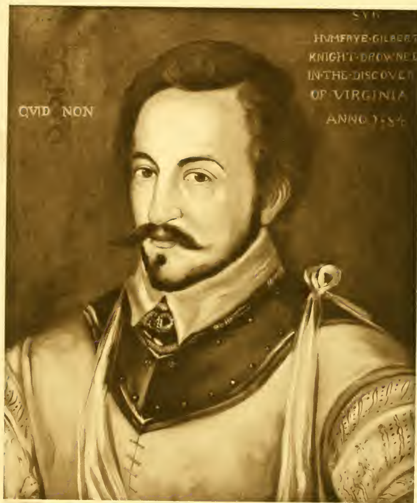
Sir Humphrey Gilbert.