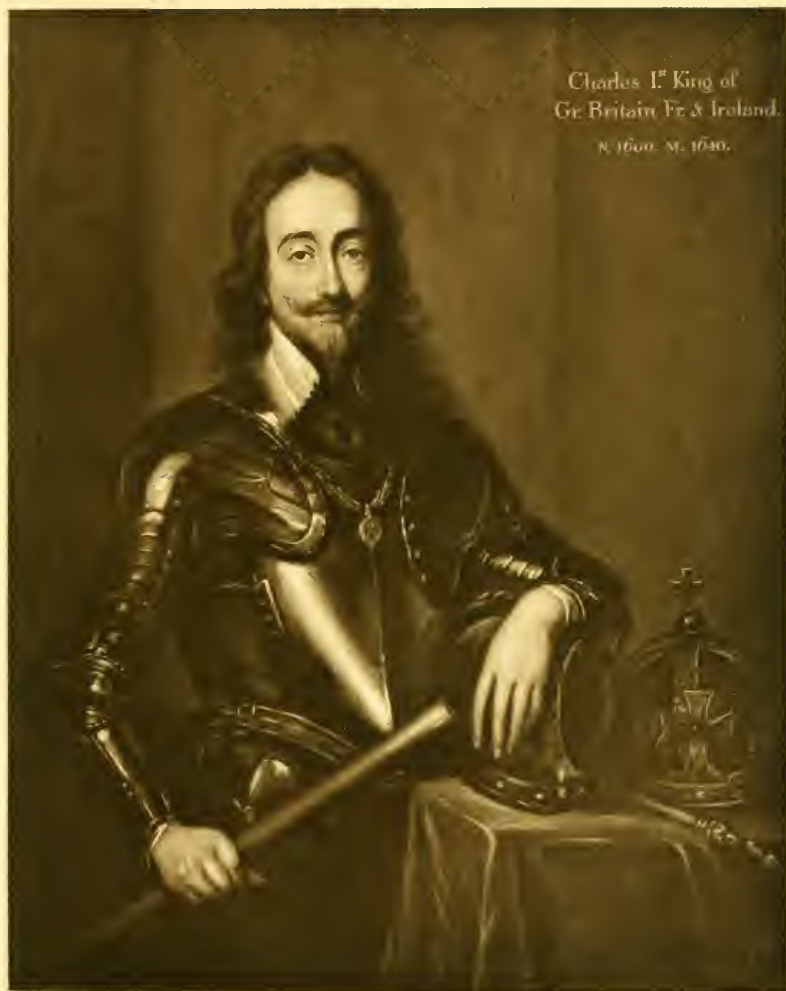
King Charles I. after the painting by Van Dyck