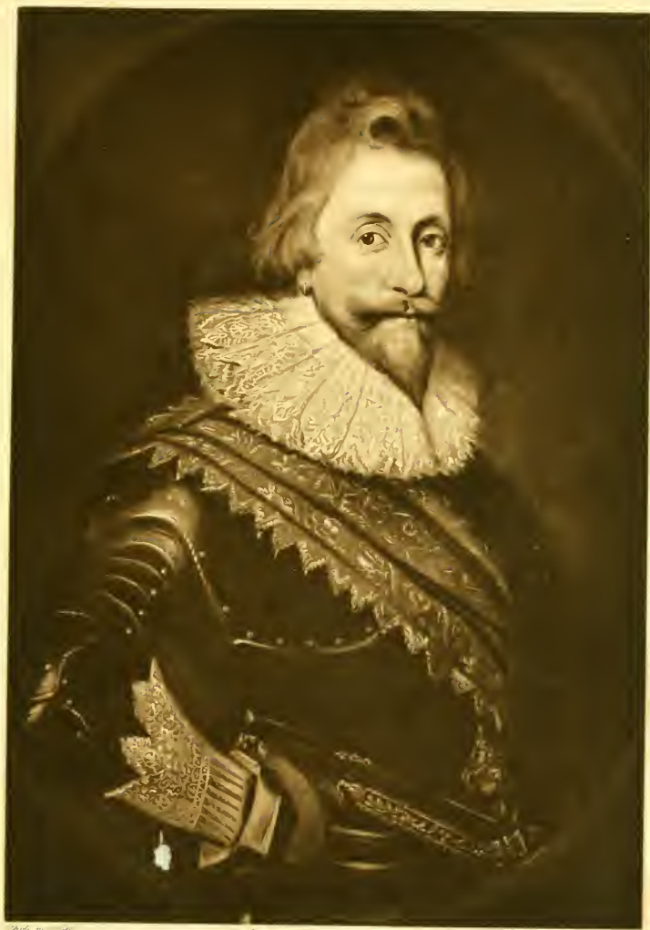
Henry Crothkesley (Third Earl of Southampton) from the painting by Michiel Jansz van Miereveldt.