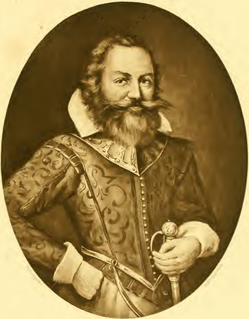
Captain John Smith.