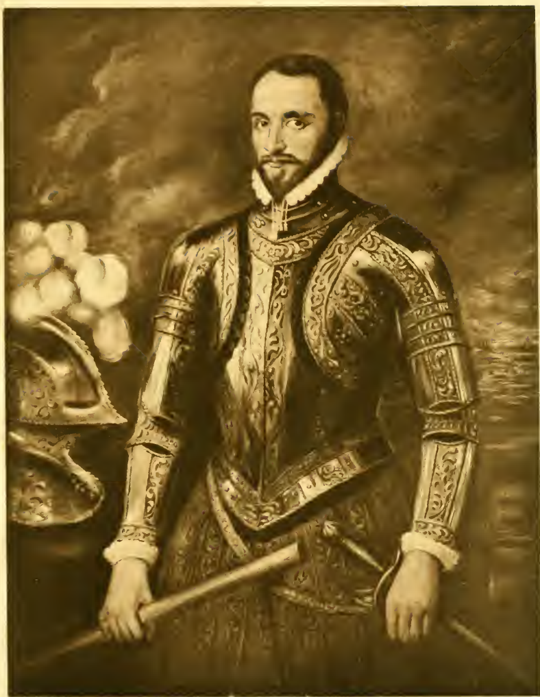
Sir Richard Grenville.