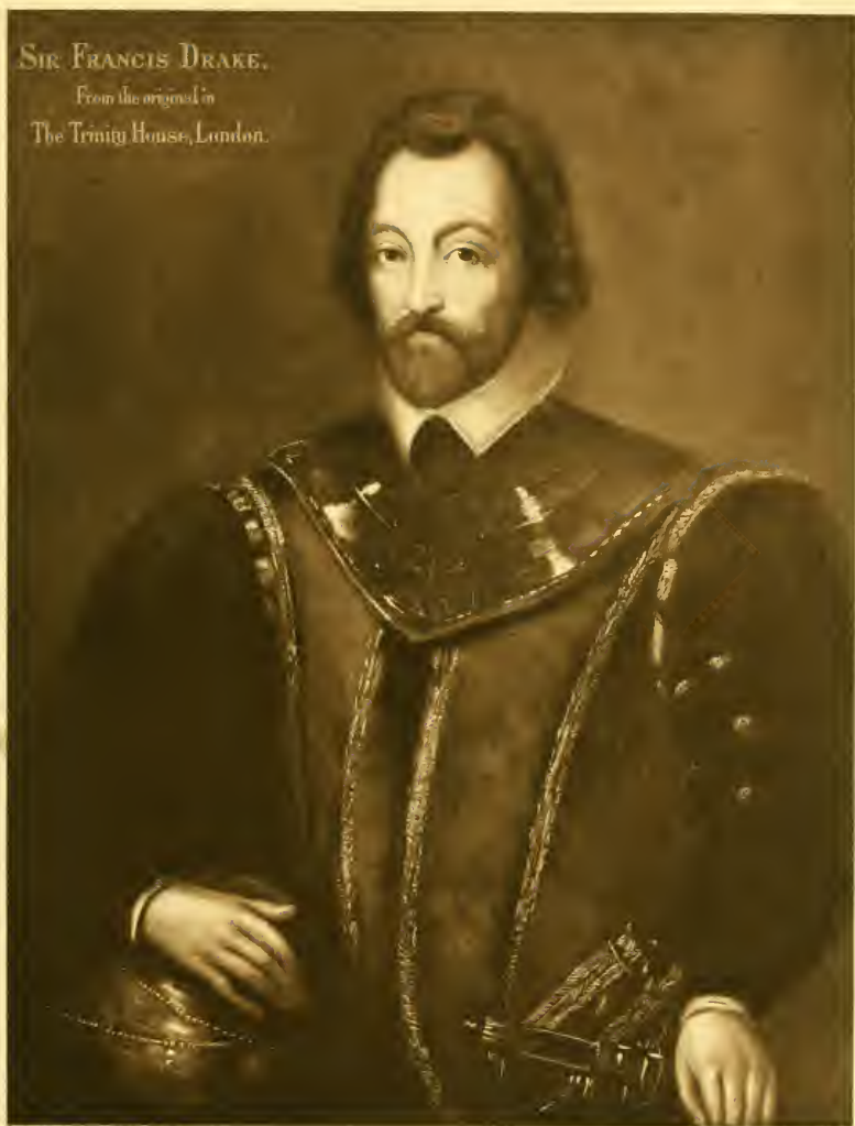
Sir Francis Drake from the painting in the Trinity House, London

From the original in The Trinity House, London.