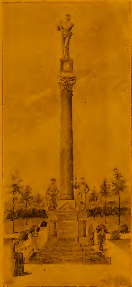
Confederate Monument at Clarksville.