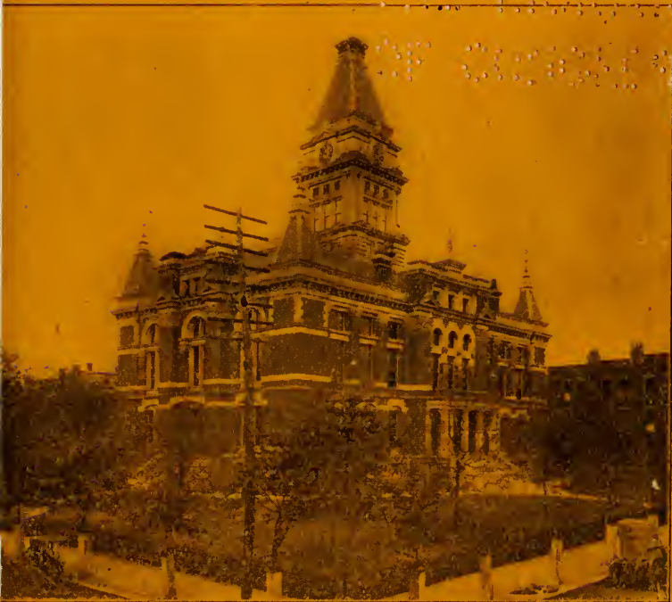
COURT HOUSE AT CLARKSVILLE.