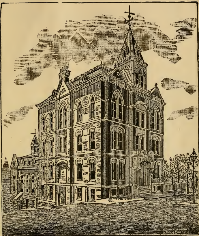
TOBACCO EXCHANGE, CLARKSVILLE.