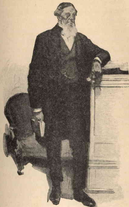
"Elder Hoover was accounted a powerful exhorter in our parts."

The Widow was badly disappointed, but she allowed that that was just like Bud. He'd always been a boy that never could be found when any one wanted him. So she went off, saying that she'd had her money's worth in seeing Clytie throw those fancy