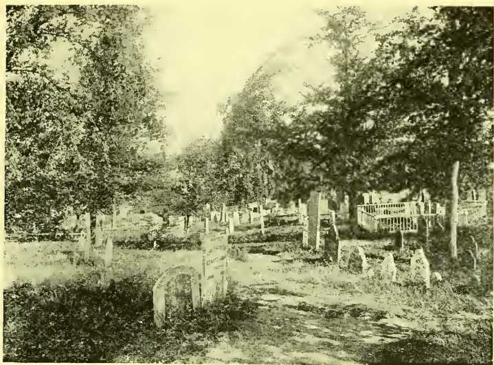
BURIAL HILL, PLYMOUTH, MASS.