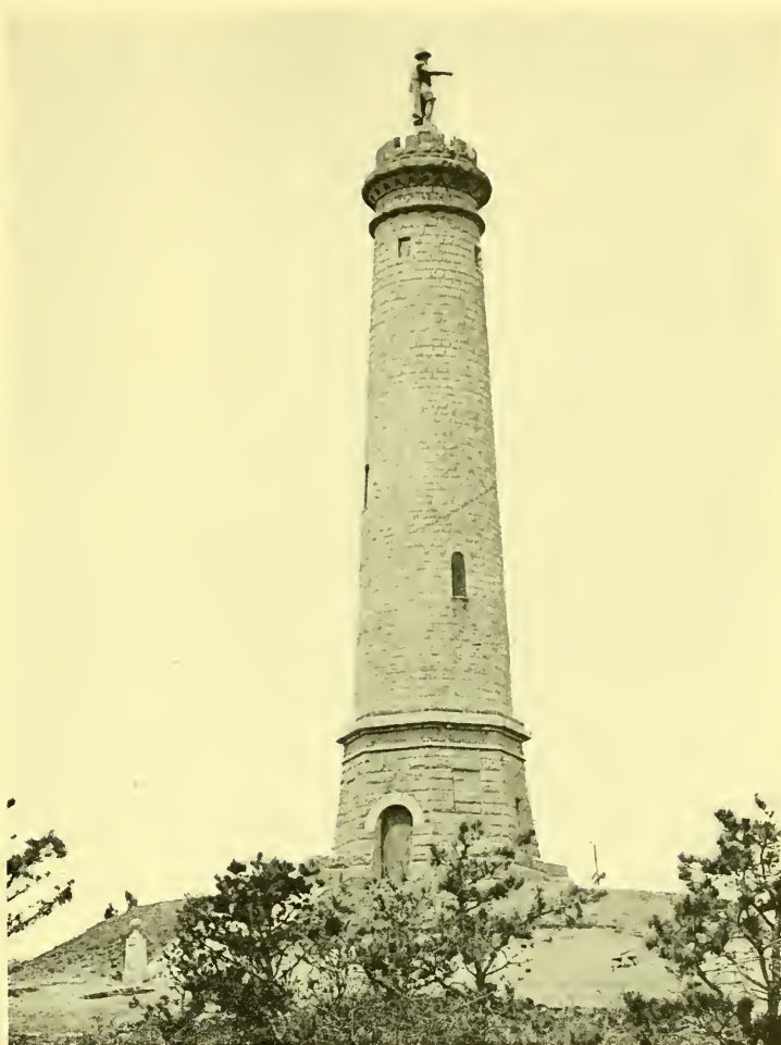
MONUMENT TO CAPTAIN MYLES STANDISH, CAPTAIN'S HILL, DUXBERRY, MASS.