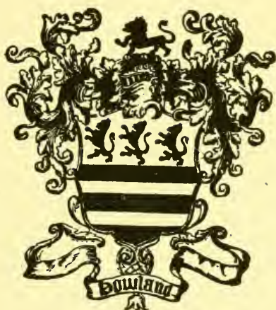
The Arms of the Howland Family