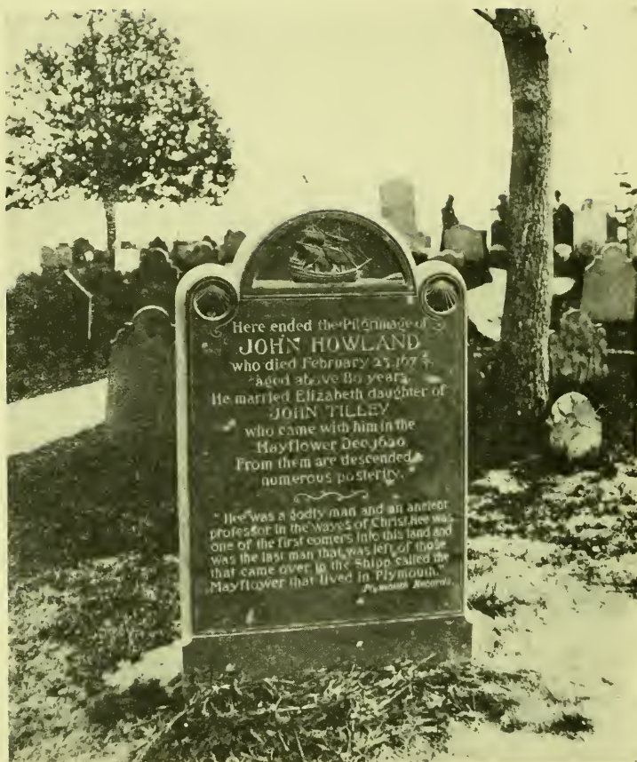
THE TOMBSTONE OF JOHN HOWLAND, THE PILGRIM, Burial Hill, Plymouth