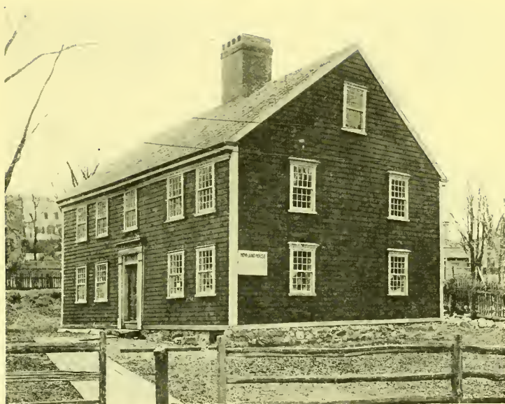
THE HOWLAND HOUSE, PLYMOUTH, MASS., built 1667