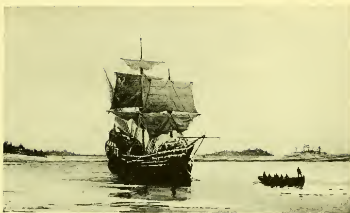
THE MAYFLOWER AT ANCHOR, 1620