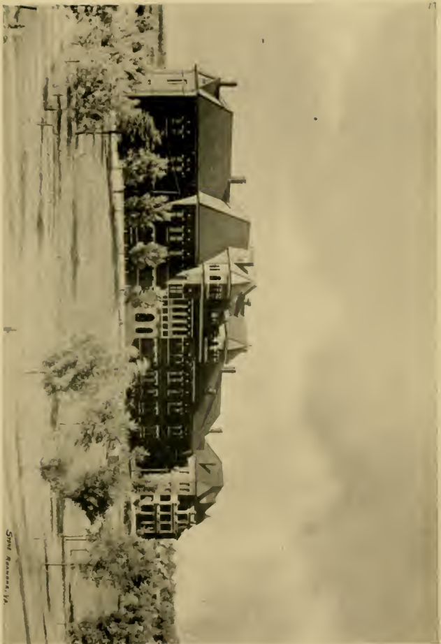
State Normal, Va.