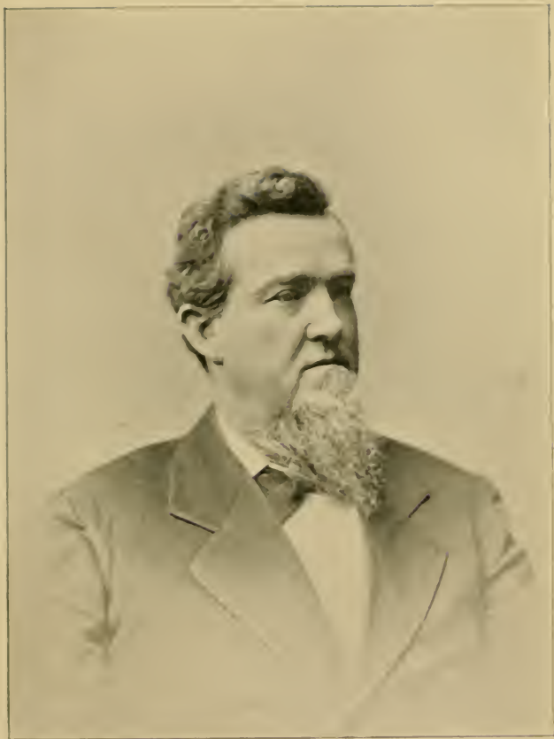
ALFRED MOORE SCALES, GENERAL IN THE CONFEDERATE ARMY IN NORTHERN VIRGINIA, GOVERNOR OF NORTH CAROLINA, ELDER IN THE FIRST PRESBYTERIAN CHURCH OF GREENSBORO, LAWYER-STATESMAN.