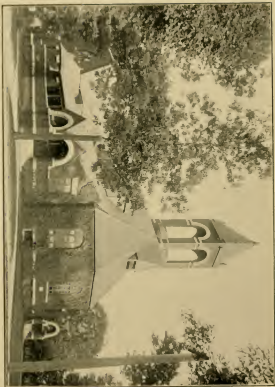
NEW FIRST PRESBYTERIAN CHURCH.