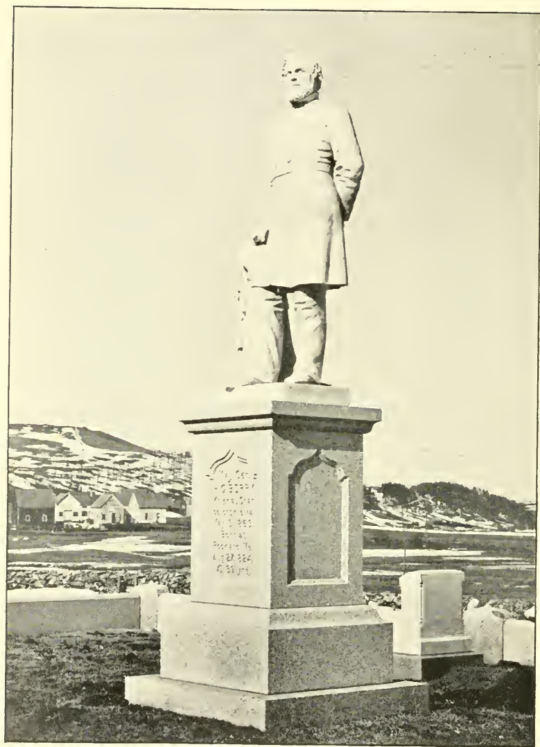
MAJOR-GENERAL BERRY'S MONUMENT.