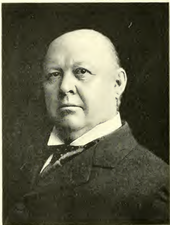
HON. THOMAS B. REED.