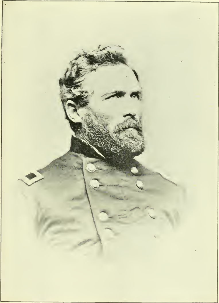
MAJOR-GENERAL HIRAM G. BERRY.